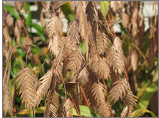
Northern Sea Oats fruit

Northern Sea Oats will grow to be about 4 feet tall at maturity, with a spread of 30 inches. Its foliage tends to remain dense right to the ground, not requiring facer plants in front. It grows at a medium rate, and under ideal conditions can be expected to live for approximately 10 years. As an herbaceous perennial, this plant will usually die back to the crown each winter, and will regrow from the base each spring. Be careful not to disturb the crown in late winter when it may not be readily seen!