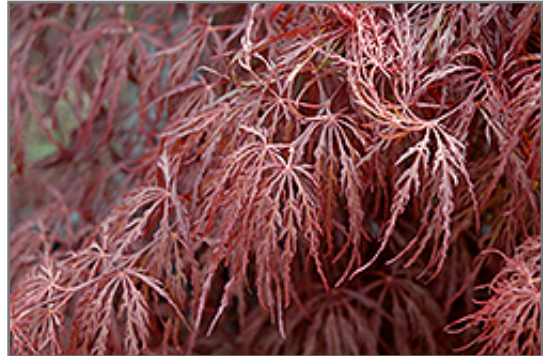
Crimson Queen Japanese Maple foliage

Crimson Queen Japanese Maple is recommended for the following landscape applications;