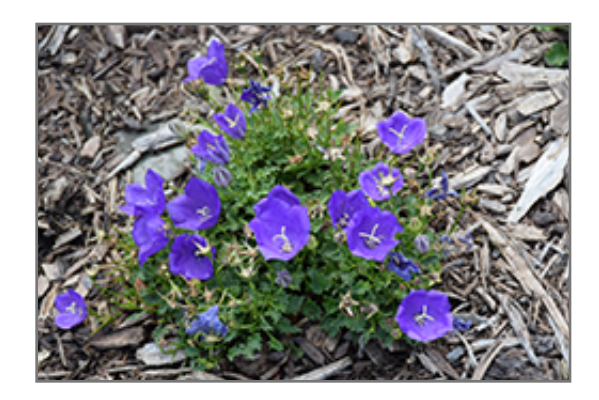
Pearl Deep Blue Bellflower in bloom

Pearl Deep Blue Bellflower is recommended for the following landscape applications;