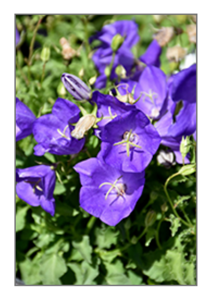
Pearl Deep Blue Bellflower flowers

This is a relatively low maintenance plant, and is best cleaned up in early spring before it resumes active growth for the season. It is a good choice for attracting butterflies to your yard. It has no significant negative characteristics.