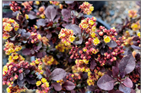
Concorde Japanese Barberry flowers

Concorde Japanese Barberry will grow to be about 18 inches tall at maturity, with a spread of 24 inches. It tends to fill out right to the ground and therefore doesn't necessarily require facer plants in front. It grows at a slow rate, and under ideal conditions can be expected to live for approximately 20 years.