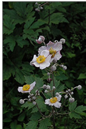
Grapeleaf Anemone flowers