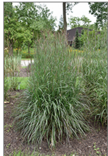
Blackhawks Bluestem in bloom

5020 Texas Drive Kalamazoo, MI 49009 Phone: 269-345-1195 Fax: 269-345-8930 wedels.com