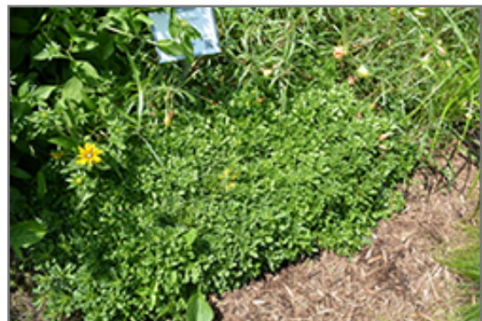
Czar's Gold Stonecrop

5020 Texas Drive Kalamazoo, MI 49009 Phone: 269-345-1195 Fax: 269-345-8930 wedels.com