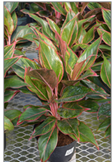
Siam Aurora Chinese Evergreen in full