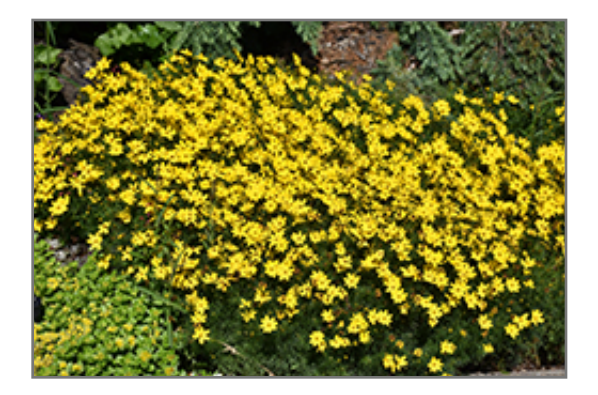
Zagreb Tickseed in bloom

Zagreb Tickseed is an open herbaceous perennial with a mounded form. It brings an extremely fine and delicate texture to the garden composition and should be used to full effect.