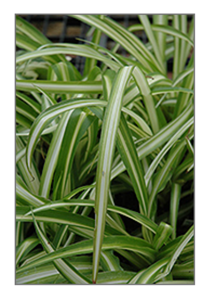
Spider Plant foliage

When grown indoors, Spider Plant can be expected to grow to be about 24 inches tall at maturity, with a spread of 24 inches. It grows at a medium rate, and under ideal conditions can be expected to live for approximately 10 years. This houseplant performs well in both bright or indirect sunlight and strong artificial light, and can therefore be situated in almost any well-lit room or location. It is very adaptable to both dry and moist soil, but will not tolerate any standing water. The surface of the soil shouldn't be allowed to dry out completely, and so you should expect to water this plant once and possibly even twice each week. Be aware that your particular watering schedule may vary depending on its location in the room, the pot size, plant size and other conditions; if in doubt, ask one of our experts in the store for advice. It is not particular as to soil type or pH; an average potting soil should work just fine.