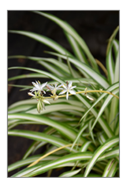
Spider Plant flowers