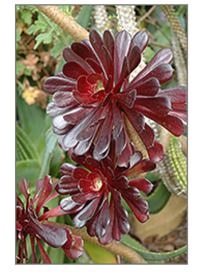
Schwarzkopf Stonecrop foliage

Schwarzkopf Stonecrop has clusters of yellow star-shaped flowers from early to late summer. Its attractive succulent oval compound leaves emerge purple, turning deep purple in color with showy burgundy variegation throughout the year.