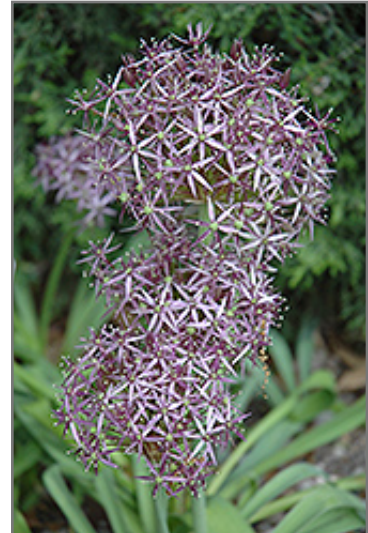
Star Of Persia Onion flowers

Star Of Persia Onion is recommended for the following landscape applications;