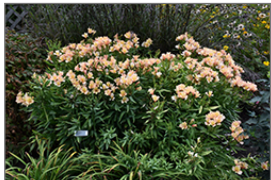
Inca Ice Alstroemeria in bloom

5020 Texas Drive Kalamazoo, MI 49009 Phone: 269-345-1195 Fax: 269-345-8930 wedels.com