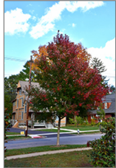
Redpointe Red Maple in fall

This tree should only be grown in full sunlight. It is quite adaptable, preferring to grow in average to wet conditions, and will even tolerate some standing water. It is not particular as to soil type, but has a definite preference for acidic soils, and is subject to chlorosis (yellowing) of the leaves in alkaline soils. It is somewhat tolerant of urban pollution. This is a selection of a native North American species.