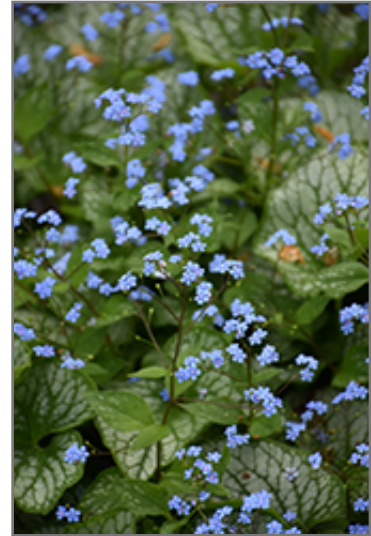
Sea Heart Bugloss flowers

Sea Heart Bugloss is recommended for the following landscape applications;