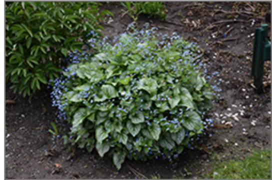
Sea Heart Bugloss in bloom

Sea Heart Bugloss will grow to be about 12 inches tall at maturity extending to 16 inches tall with the flowers, with a spread of 18 inches. When grown in masses or used as a bedding plant, individual plants should be spaced approximately 14 inches apart. It grows at a medium rate, and under ideal conditions can be expected to live for approximately 10 years. As an herbaceous perennial, this plant will usually die back to the crown each winter, and will regrow from the base each spring. Be careful not to disturb the crown in late winter when it may not be readily seen!