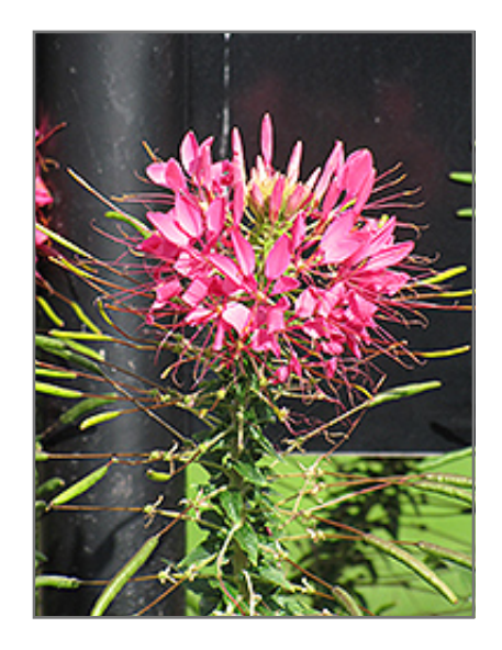
Rose Queen Spiderflower flowers

Rose Queen Spiderflower is recommended for the following landscape applications;