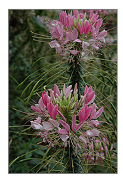
Rose Queen Spiderflower flowers

5020 Texas Drive Kalamazoo, MI 49009 Phone: 269-345-1195 Fax: 269-345-8930 wedels.com