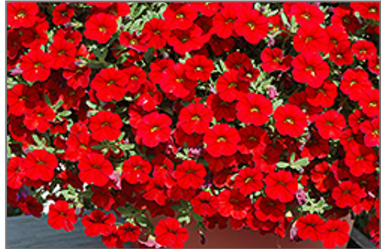
Cabaret Bright Red Calibrachoa flowers

Cabaret Bright Red Calibrachoa is a dense herbaceous annual with a trailing habit of growth, eventually spilling over the edges of hanging baskets and containers. Its medium texture blends into the garden, but can always be balanced by a couple of finer or coarser plants for an effective composition.