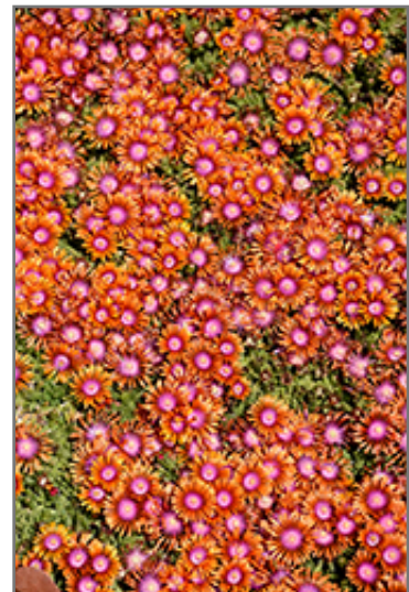
Fire Spinner Ice Plant flowers

5020 Texas Drive Kalamazoo, MI 49009 Phone: 269-345-1195 Fax: 269-345-8930 wedels.com