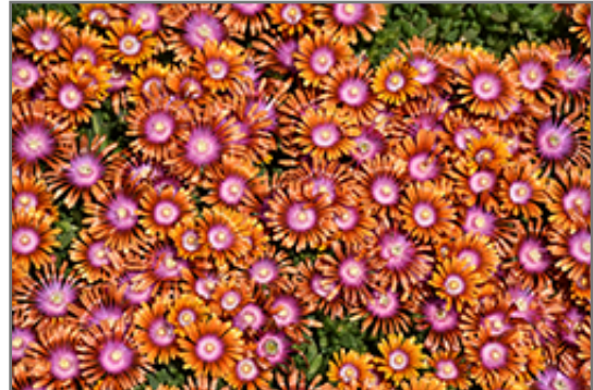
Fire Spinner Ice Plant in bloom

Fire Spinner Ice Plant is recommended for the following landscape applications;